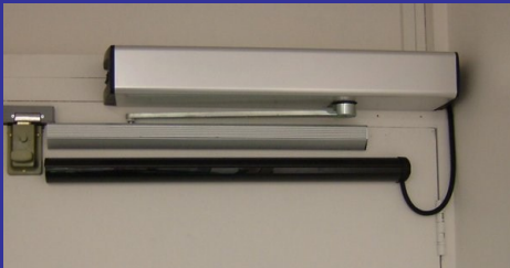
Automated Pull Open Door

All Automated Doors can be connected to a Central Door Access System.